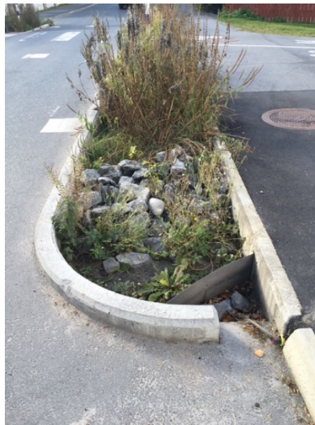
Fig. 4 A biofilter.

In Table 1, minimum outflow concentrations from the International BMP Database and the StormTac database are compiled for different facility types. The