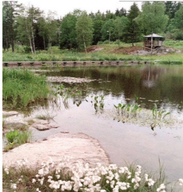
Fig. 1 A wet pond with shallow wetland areas.