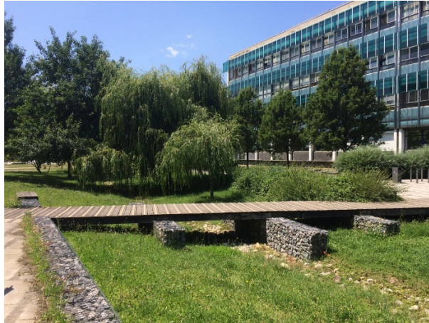
Fig. 3 A swale.